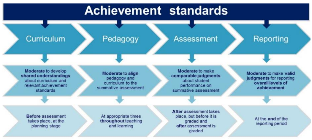
Diagram 2 : Moderation: an interrelated process that enables teachers to align curriculum, pedagogy, assessment and reporting.